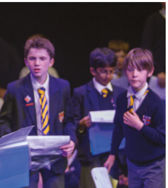
Top left: Over half our pupils have private instrumental lessons Middle left: Rugby at our sports ground in Failand Top right: So what happens next in your story? Middle right: Sharing insights in the IT suite Bottom: A drama rehearsal in our purpose-built, 220-seat theatre

We want all our pupils to develop strong moral values, to understand right from wrong and respect others. This is why we place a lot of emphasis on personal qualities such as good manners, reliability, and caring for others. We do this with a light touch and a sense of humour, working closely with you to create a warm, supportive, homely environment. The result is pupils who have a positive self-image, who feel happy, safe and secure, and who have a growing sensitivity to the needs of others.