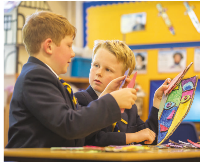
Top left: Choosing a book in our dedicated Junior School library Middle left: An impromptu header in the yard Middle right: Creating Picasso-inspired art Bottom: Cricket is one of many sports played

We fire imaginations, both inside and outside the classroom, helping boys develop confidence, an appreciation of the arts, and the ability to work with others. Music, art and drama are an important and integral part of the weekly curriculum. So is sport. Boys enjoy two afternoons of sport at our superb sports ground at Failand as well as weekly PE and swimming lessons.