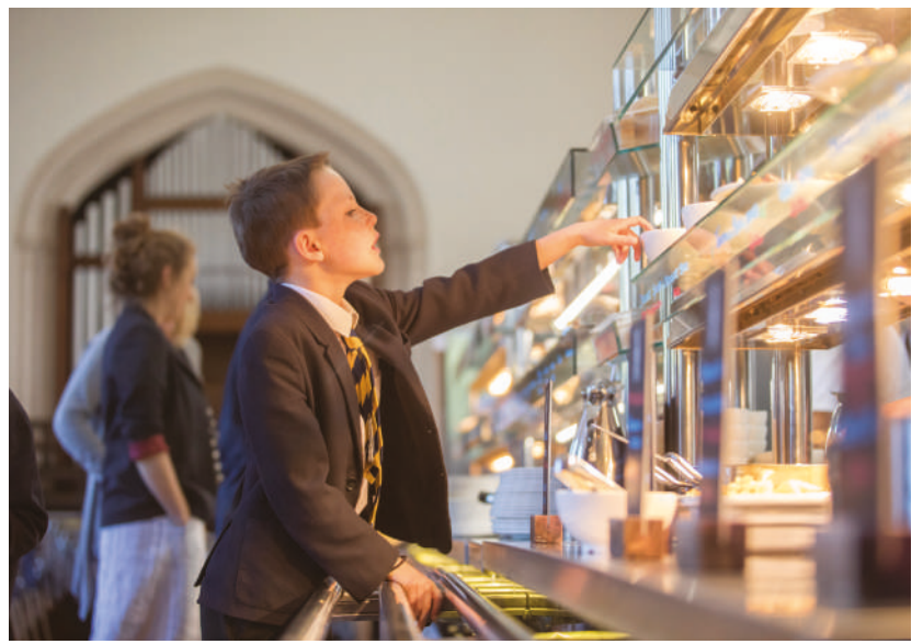
Top: And they're off! Runners compete in Sports Day Bottom: 'I'll have that please!' - lunches are attractive as well as healthy